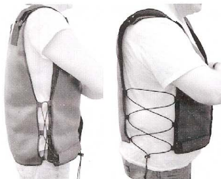
Elastic Cord Adjustment