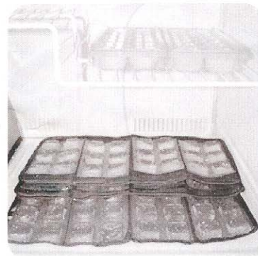
Ice Panels in Freezer