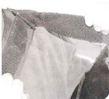
Velcro Shoulder Strap

Ice Vest is designed to fit sizes XS to 2XL. Vest can be adjusted at shoulders via the Velcro straps and also on the sides by adjusting the elastic cord. Excess elastic cord should be secured inside the Velcro flap on the front of vest for safety. A shirt should be worn underneath vest to avoid direct contact of ice panels with skin. Vest should be adjusted to fit so that ice panels are in full contact with body.