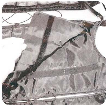
Ice Panels Attach with Velcro Strips

Removable ice panels attach to the vest with Velcro for ease of use. For best results place panels flat in freezer. Flexi Freeze ice will require approximately 12 hours to become fully frozen. If upon removal from freezer individual cubes do not appear fully frozen, slightly tap the unfrozen cubes to facilitate crystallization and return panels to complete freezing. Remove panels from freezer and attach to vest when personal cooling is required. Ice panels should be stored in freezer when the vest is not in use to ensure panels are readily frozen.